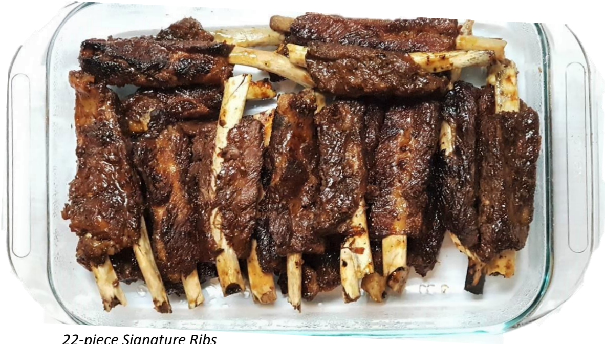
22-piece Signature Ribs