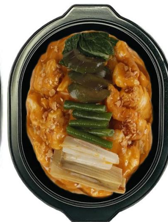
Kare Kare with Bagoong