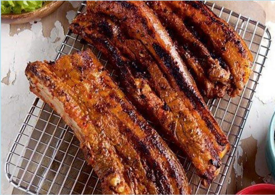
Landrina's Grilled Liempo